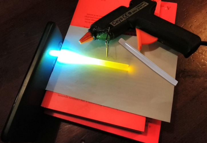
With a hot-melt silicone rod.

he experience that comes in the book quoted, with an overhead projector and a glass of diluted milk solution is good, but has the disadvantage that it is increasingly difficult to get an overhead projector for transparencies. Here we offer you a very easy alternative.